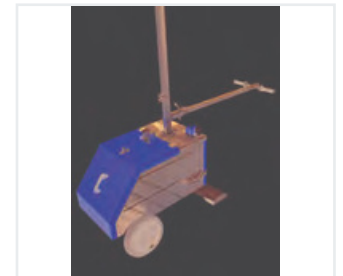
LZA 550-LED Battery box with handle