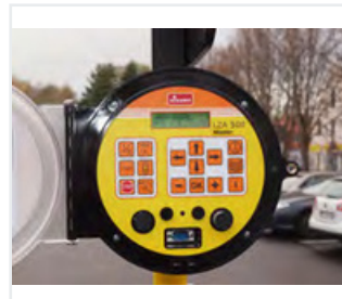
LZA 550-LED Controller